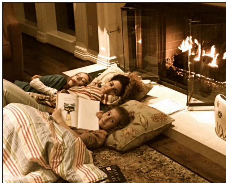
Reading by the fireplace – looks so cozy!

It turned to be a great exchange for all of us. We even met ten of