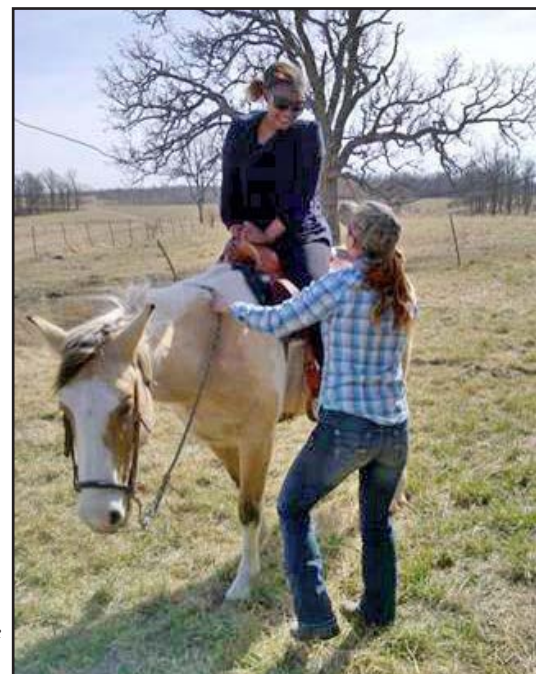
Horseback riding in the beautiful Missouri nature.