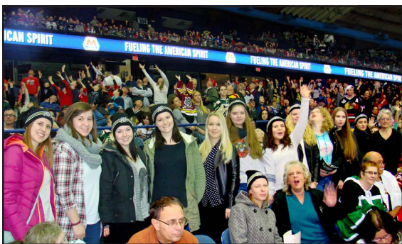
Chicago Au Pairs, Host Families, Community Counselors and Area Coordinator attended a Chicago Wolves ice hockey game in February. Everybody had a great time and EurAupair was even mentioned on the scoreboard!