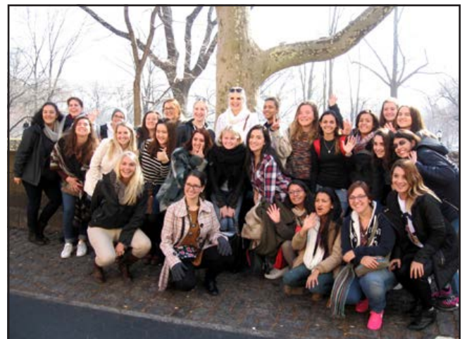
This picture shows our March arriving Au Pairs at the EurAupair workshop in New York City. How convenient that the Au Pairs can take their break just across the street at Central Park!